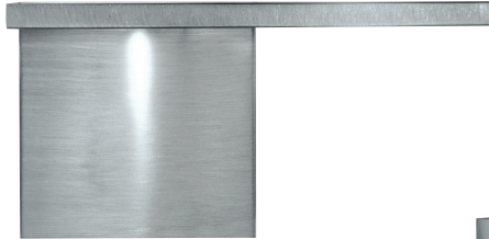
Edge Sconce 1120-BA-AC Front view