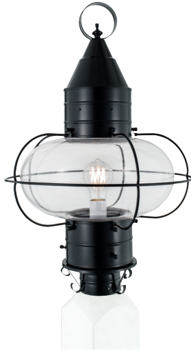
Classic Onion Post Large 1510-BL-CL

Sconces and Ceiling also available see 1509, 1512, 1513, 1508