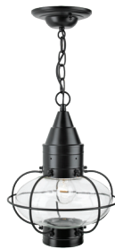
Classic Onion Ceiling See 1508 Technical Sheet