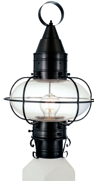
Classic Onion Post Medium 1511-BL-CL