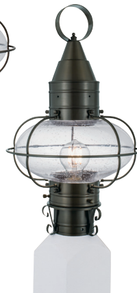
Classic Onion Post Medium 1511-GM-SE