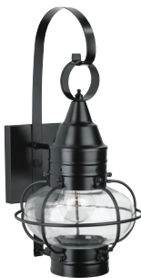
Classic Onion Sconces See 1509, 1512, 1513 Technical Sheet