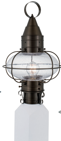
Classic Onion Post Medium 1511-BR-SE