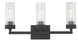
3 Light 2613