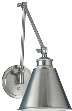
Aiden Swing Arm 8475-BN-MS