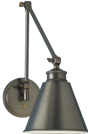
Aiden Swing Arm 8475-AR-MS