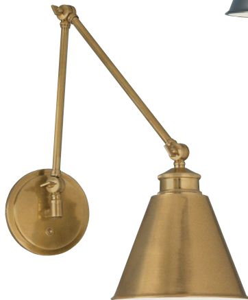
Aiden Swing Arm 8475-AG-MS