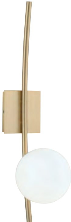
Perch Sconce 9681-SB-OP