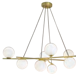
For Perch Chandelier. See 9680 technical sheet