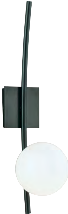
Perch Sconce 9681-ADB-OP